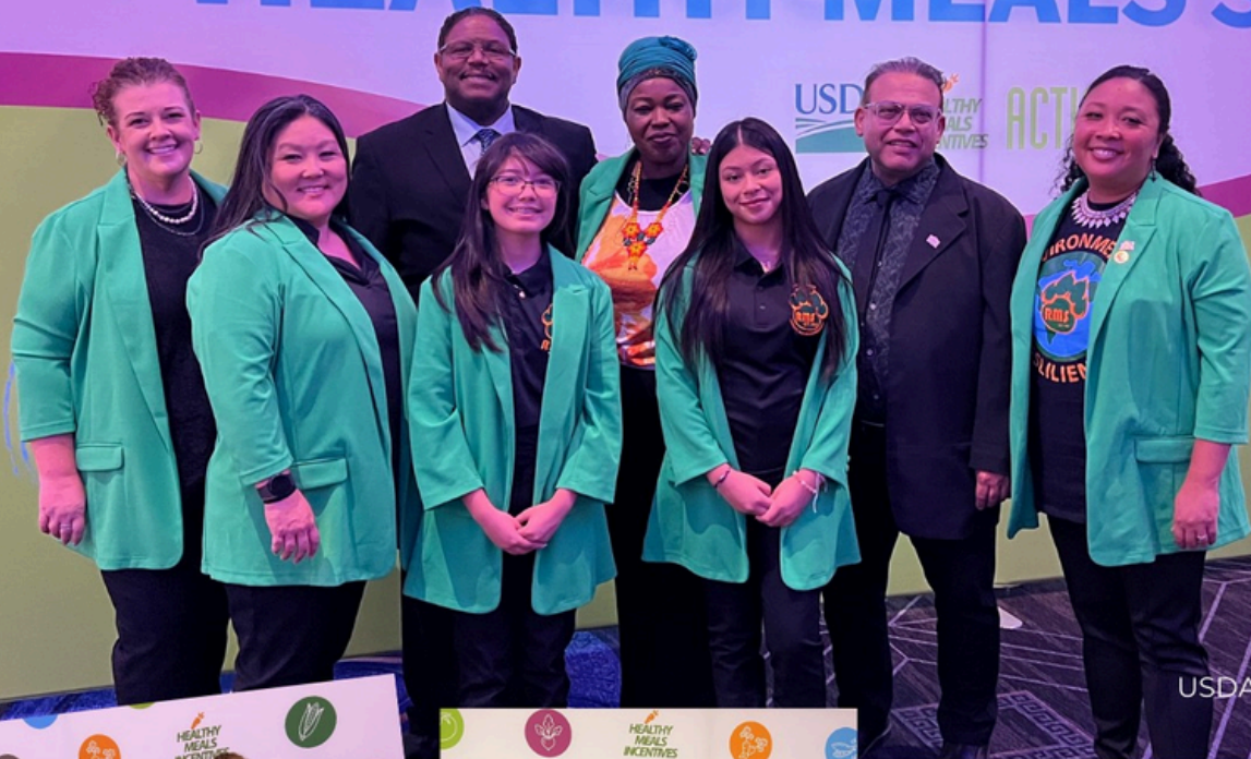
USDA Healthy Meals Summit Las Vegas 2024